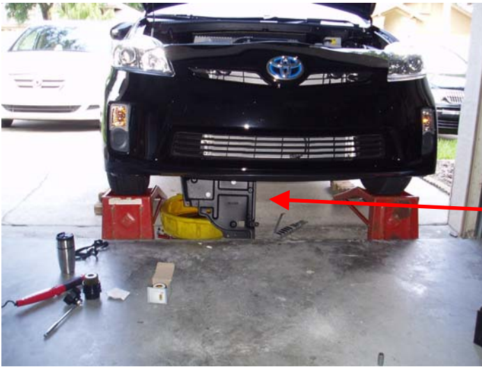
Oil Filter and Oil Pan Access Panel

Be careful not to damage the front air-dam (you many need low profile ramps) when driving onto the ramps.